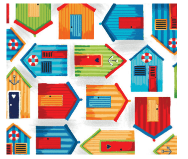
2345/W Set Beach Huts