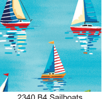
2340 B4 Sailboats