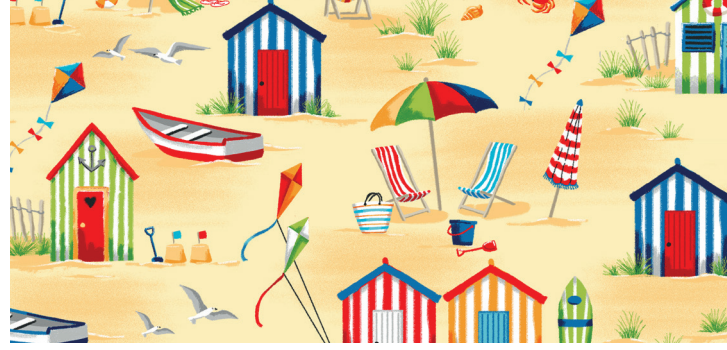
2341/1 Beach Huts