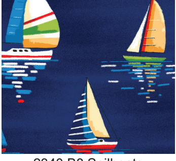
2340 B8 Sailboats