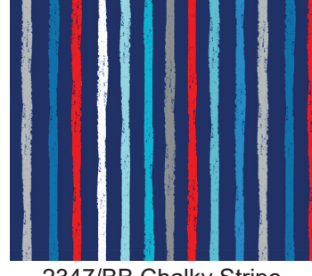
2347/BB Chalky Stripe