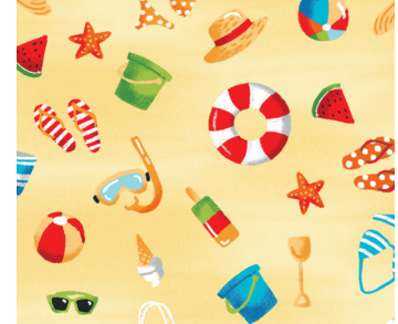
2339/Y Icon Scatter