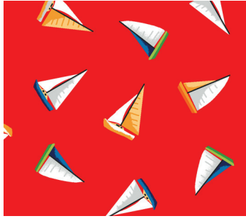
2343/R Mini Boats