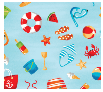
2339/B Icon Scatter