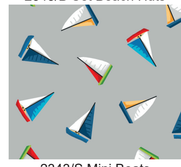
2343/S Mini Boats